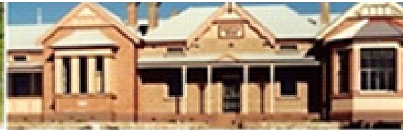
Our future restoration plan